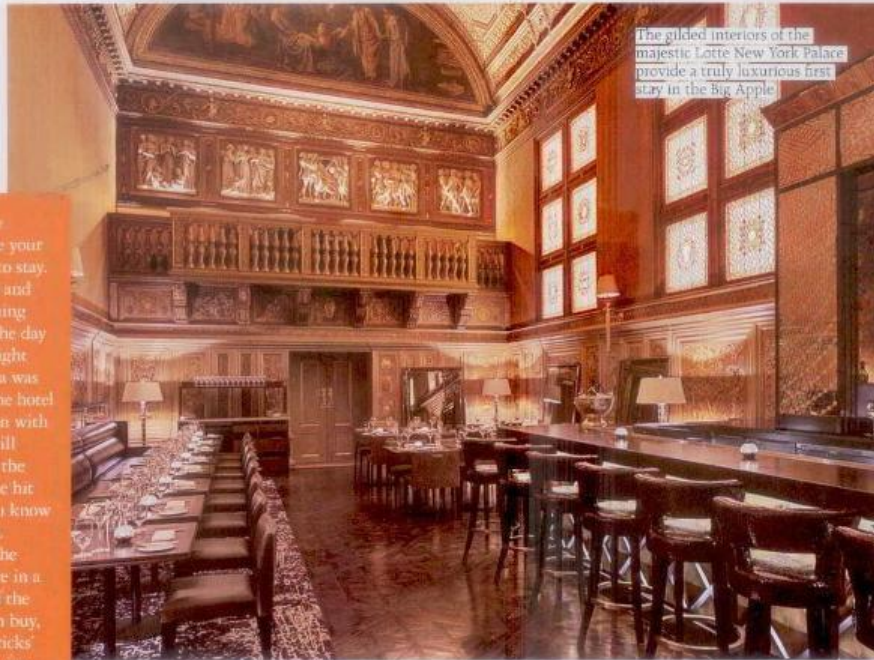
The gilded interiors of the majestic Lotte New York Palace provide a truly luxurious first stay in the Big Apple.

The hotel boasts of some of the best views of the city and if you're in a mood to splurge it offers some of the most luxurious rooms money can buy, ask for one with a view of St. Patrick's Cathedral, you'll be left picking your jaw off the floor.